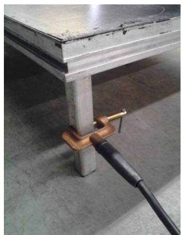
Mobile Stage frame bonded